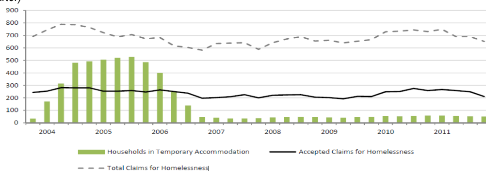
Fig 1 – Homeless Applications and Acceptances and Homeless Households in Temporary Accommodation Q1 2003- Q4 2011 for Swansea (Source: Local Authority P1E Homelessness Data. Note: Number of cases based on 12 months to end of quarter)

The Department of Work and Pensions (DWP) together with statistics released annually by Welsh Government (WG) show that over 6% of households in Swansea claim housing benefit while living in the private rented sector, which is slightly higher than the average for the whole of Wales. Many households choose to live in private rented accommodation with housing benefit support and there are obvious financial implications for increased numbers of households relying on public subsidy to live in the private rented sector, which could be mitigated by increased numbers of affordable dwellings.